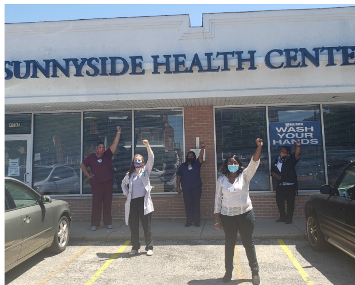
Above: Near North staff members at Sunnyside Health Center, located at 4501 N. Sheridan Road in Chicago, standing in memory of George Floyd.

At each site prior to the moment of silence, the following statement was read: "We as representatives of Near North Health Service Corporation are standing in memory of George Floyd, his life and our hope for peace, restoration and justice."